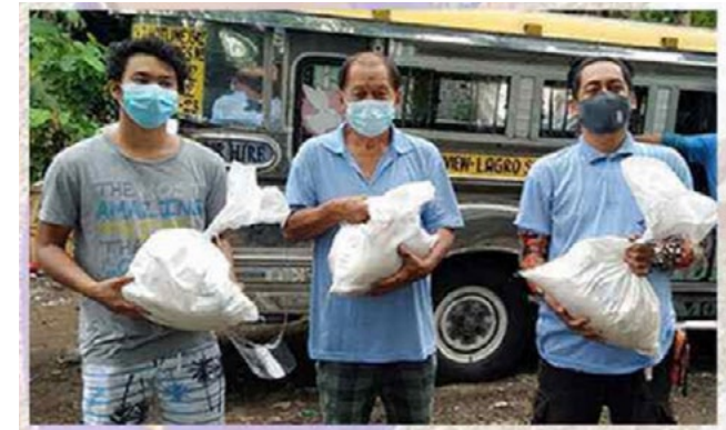
JEEPNEY DRIVERS DELIVERING RELIEF AND HOPE