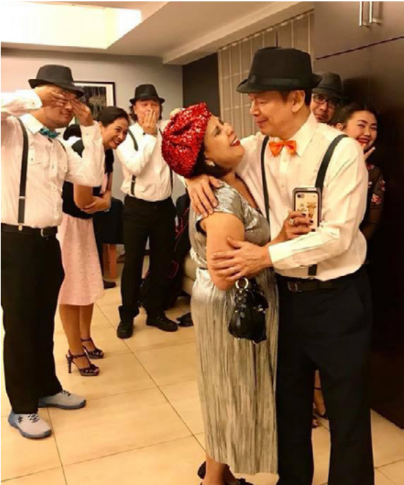
Catechism teachings also say:

It only asks for light or guidance, as to what action is beautiful in the eyes of God. It asks for help to rule against what’s not good for us and to guide us in the right path towards God or what is right. Such a wonderful and reassuring prayer!